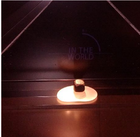
THE FIRST HOCKEY PUCK

Lacrosse is one of the oldest team sports in North America. It has its origins in a tribal game played by Eastern Woodlands First Nations peoples around the Great Lakes . The first hockey puck in Canada can be seen in the Original Hockey Hall of Fame in Kingston. It is a lacrosse ball that was shaved off and flattened so that it would slide along the ice. In 1843 a British Army officer in Kingston, Ontario wrote, "Began to skate this year, improved quickly and had great fun at hockey on the ice." This was the first time anyone wrote about playing ice hockey in Canada and this is why some people believe Ice Hockey was first played in the city of Kingston Ontario!