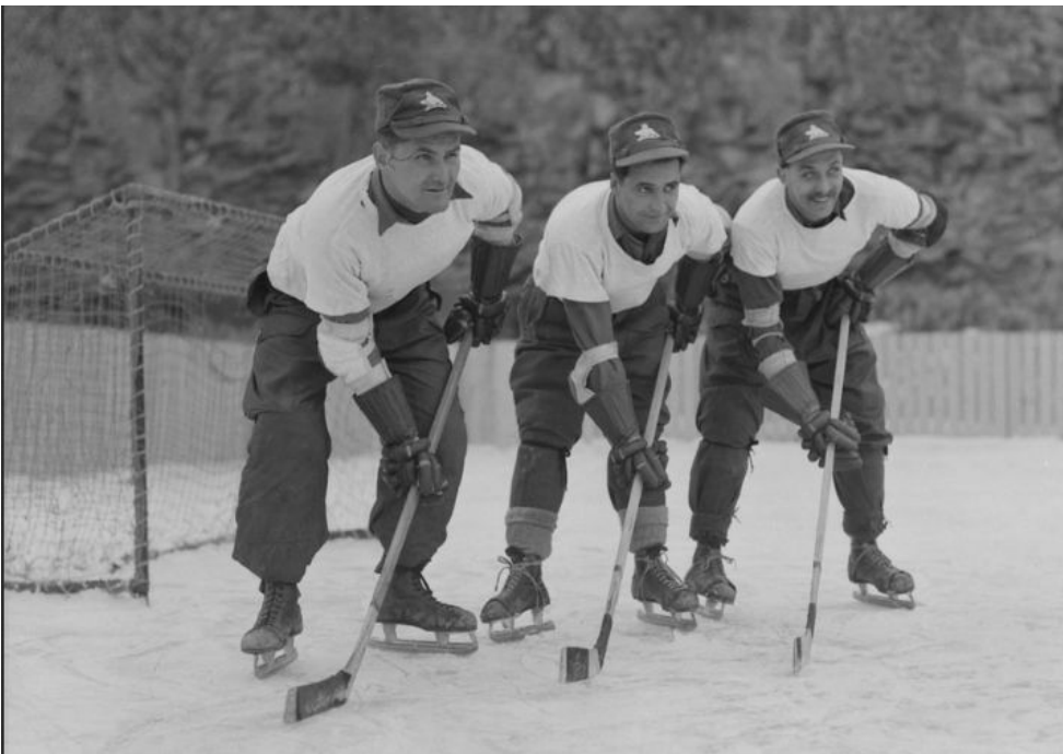
Players - 1953