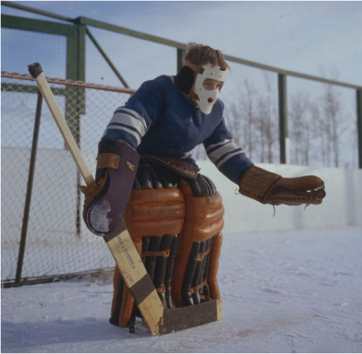
Goalie - 1961